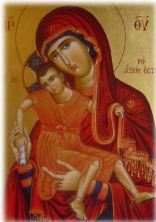
To Agion Esti "The Axion Esti" (iconography with handcarved customized frame) - Copyright, Despina Fountoglou

10% of sales proceeds will go to Philoptochos Society of Saint Sophia Greek Orthodox Cathedral